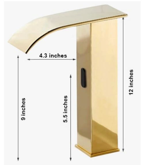
Product shown is only for installation display purpose